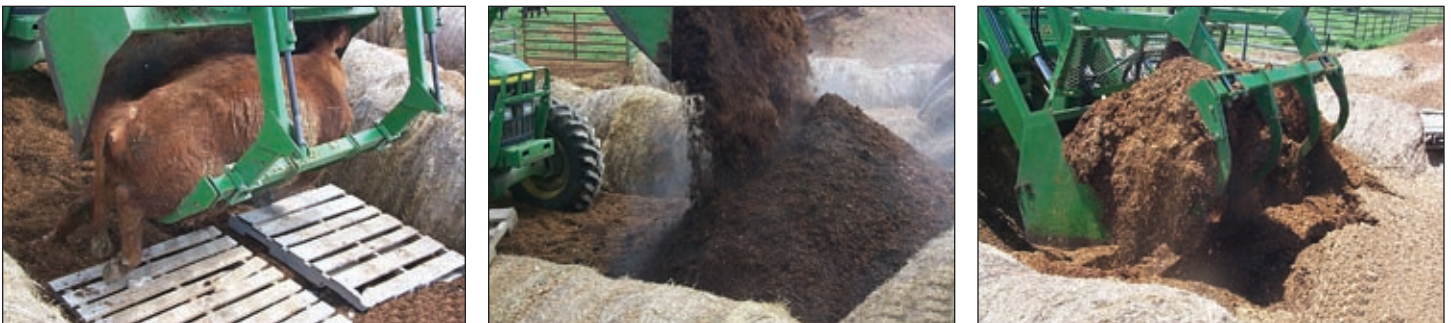
Figure 2. A front-end bucket/grapple loader is a versatile piece of machinery for depositing carcasses (left) on a compost pile and for building (center) and turning (right) the pile.