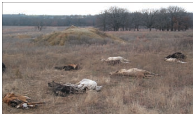
Figure 1. Leaving animal carcasses exposed to nature is not a good idea.

Every living being does best when it eats a properly balanced diet, and compost microbes are no exception. They need both carbon (C) and nitrogen (N) in the right ratio. Optimally, the nutrients in a compost pile should be about 30 parts C and 1 part N (30:1).