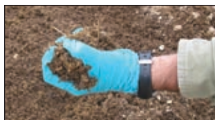
Figure 7. Monitor the moisture content of the pile.

If they do, that sample of material is too wet. If not, drop the material and look at the palm of your hand. If it does not have an obvious sheen of water on it, the sample was too dry.