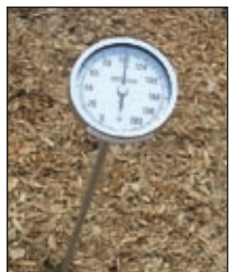
Figure 5. A long-stemmed, dial-type thermometer is used to monitor pile temperatures.

The easiest way to measure temperature at the pile's core is with a long-stemmed thermometer. It must be long enough to reach to the center of the pile. A 48-inch probe costs about $150.00. One model is the Reotemp 48-inch Heavy-Duty Windrow Thermometer ( www.reotemp.com ). Other manufacturers marketing good quality probes include Geneq ( www.geneq.com ), Omega ( www.omega.com ), Tel-Tru ( www.teltru.com ) and PTC Instruments ( www.ptc1.com ). Be sure to read the instructions carefully to learn how to insert the probe without bending or breaking the stem. Measure the temperature at various locations to determine its uniformity.