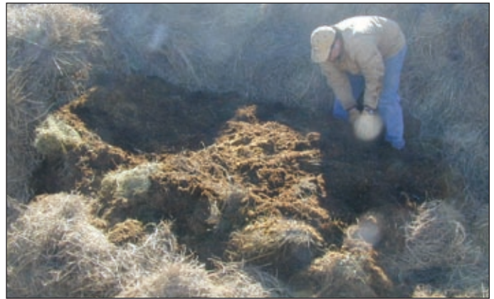
Figure 4. The co-composting material being used here is a moist mixture of horse manure and wood shavings bedding from a veterinary clinic.

To reduce odor and predator access even further, some composting specialists recommend covering the finished pile with the same dry materials used as the absorbent first layer. Doing so will improve pile insulation and heat retention, reduce oxygen transfer, and increase the volume of compost feedstocks. But it may not eliminate all odor and predators, and it is more