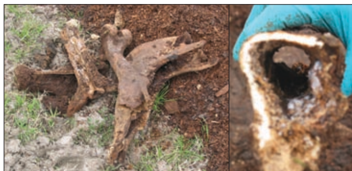
Figure 7. These bones of a 2,000-pound cow that remain from a cured compost pile are brittle, hollow, and fairly easy to crush.

After the pile is turned and moistened, the compost should heat up again and the decomposition process should continue. During this secondary phase the microbes finish off most of the available carbon and nitrogen and convert it into microbial biomass. At this point only the skull, pelvis and other large bones may still be present. Let the Phase II pile sit for about 2 more months until the temperature drops to within 10 degrees or so of the air temperature. Then turn the pile one more time and allow it to “cure” so that the remaining organic compounds (for example, acetic acid) will degrade all the way to carbon dioxide and