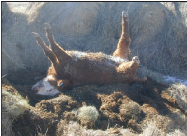
Figure 3. The limbs may need to be removed with a hacksaw, bolt cutters or shears to reduce the pile’s total volume. Lay the severed limbs beside the carcass.

CAUTION: If you suspect the animal died from a zoonotic disease (one that can be transmitted to humans), do not open the carcass. Instead, notify your veterinarian and local authorities immediately.